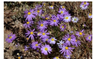
Brachyscome iberidifolia Swan River Daisy