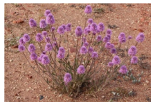
Ptilotus helipteroides Woolly Tails