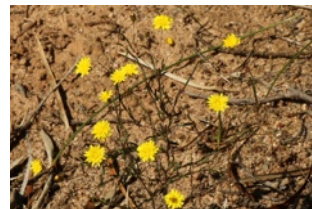
Siemssenia capillaris Invisible Plant