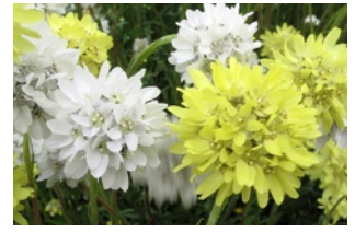
Cephalipterum drummondii Pompoms