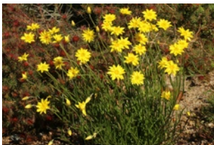
Schoenia filifolia subsp. filifolia Thread-leaved Everlasting