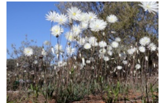
Rhodanthe chlorocephala subsp. splendida Silky White Everlasting