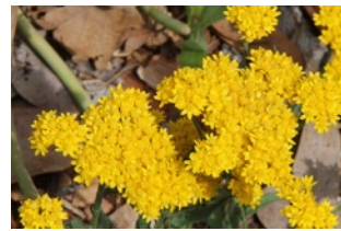
Rhodanthe humboldtiana Golden Cluster Everlasting