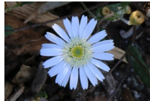
Podolepis gracilis Slender Podolepis