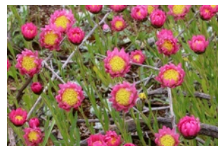
Rhodanthe rubella Ruby Everlasting