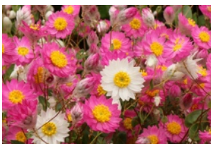
Rhodanthe manglesii Pink Sunray