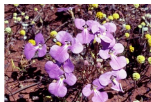
Lobelia winifredae Little Lobelia