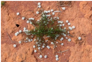
Lemooria burkittii Wires and Wool