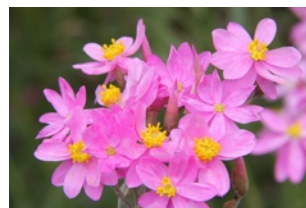
Schoenia cassiniana Pink Cluster Everlasting