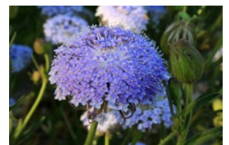
Trachymene coerulea Blue Lace Flower