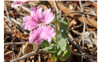
Goodenia rosea Pink Velleia