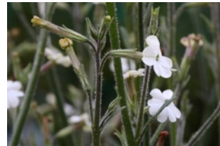
Nicotiana rotundifolia Round-leaf Tobacco