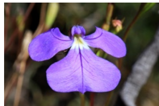
Lobelia tenuior Slender Lobelia