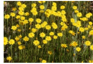
Hyalosperma glutinosum subsp. glutinosum