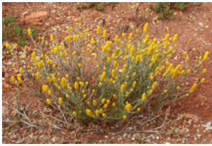
Angianthus tomentosus Camel Grass