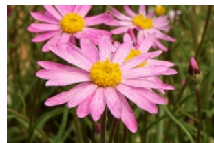
Lawrencella rosea Lindley's Everlasting