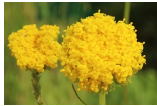
Helipterum craspediodes Yellow Billy-buttons