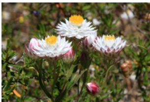
Waitzia suaveolens var. suaveolens