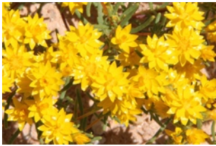
Erymophyllum glossanthus Yellow Shivery