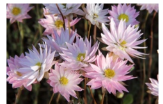
Rhodanthe chlorocephala subsp. rosea Pink & White Everlasting