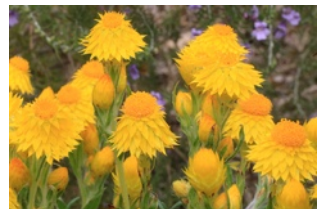
Waitzia nitida Golden Immortelle