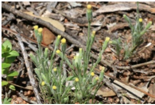
Millotia tenuifolia Soft Millotia