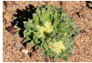
Chthonocephalus pseudovax Woolly Groundheads