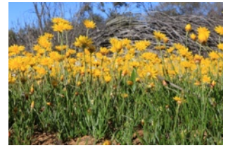
Hyalosperma glutinosum subsp. venustum Charming Sunray