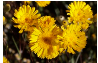
Podolepis aristata subsp. affinis