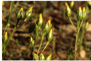
Erymophyllum tenellum Yellow Shivery