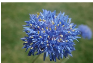
Brunonia australis Native Cornflower