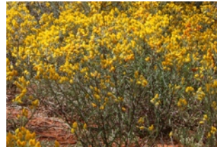
Waitzia acuminata Orange Immortelle