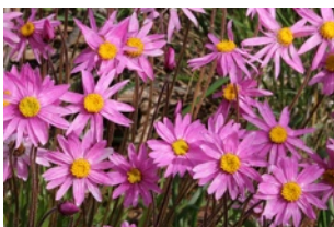
Lawrencella davenportii Sticky Everlasting