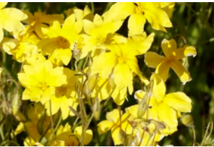
Goodenia pinnatifida Cutleaf Goodenia