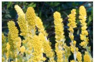
Rhodanthe spicata Spike-headed Sunray