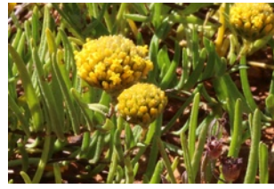
Calocephalus francisii Fine-leaf Beauty-heads