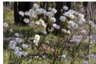
Xerochrysum macranthum Strawflower