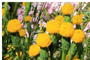
Podotheca gnaphaloides Golden Longheads